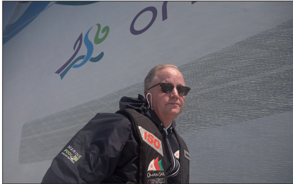
All At Sea: 'Pilates, I assume, is another word for an afternoon nap.'