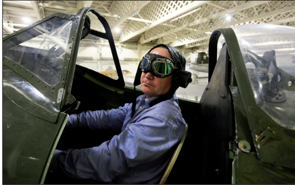
Social Animal: 'I'm disappointed by the lack of trolls on Twitter today.'