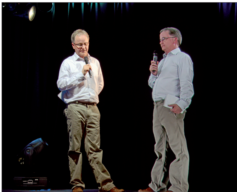
Double Vision: 'It was so funny the way you seemed to be getting annoyed with yourself.'