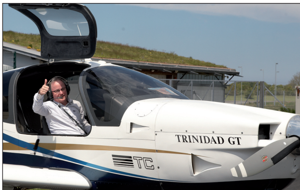
Plane Lazy: 'I have decided to commit myself to snoozing.'