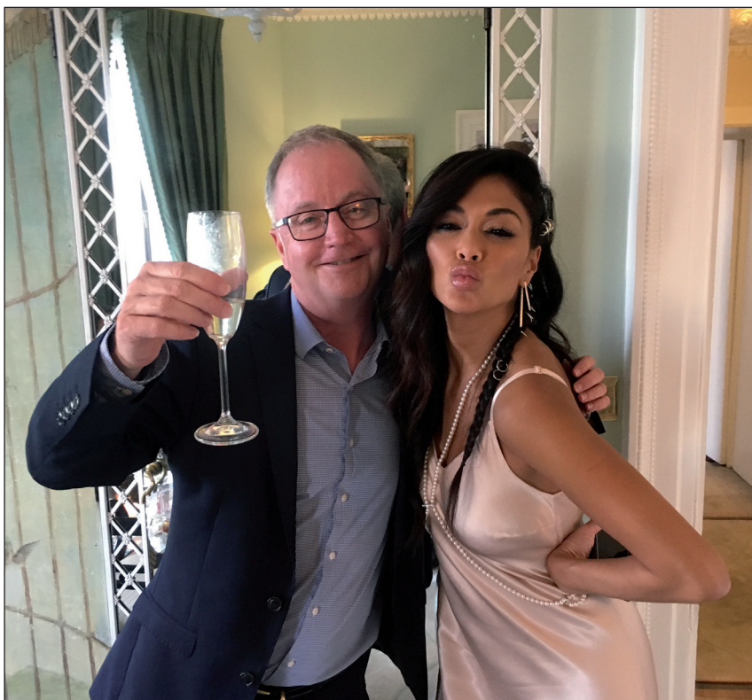
Cat Who Got The Cream: Pussycat Doll Nicole Scherzinger meets her idol at her perfume press launch.